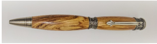
Faith Hope Love Pens

This pen uses a Parker-style Ink Refill.